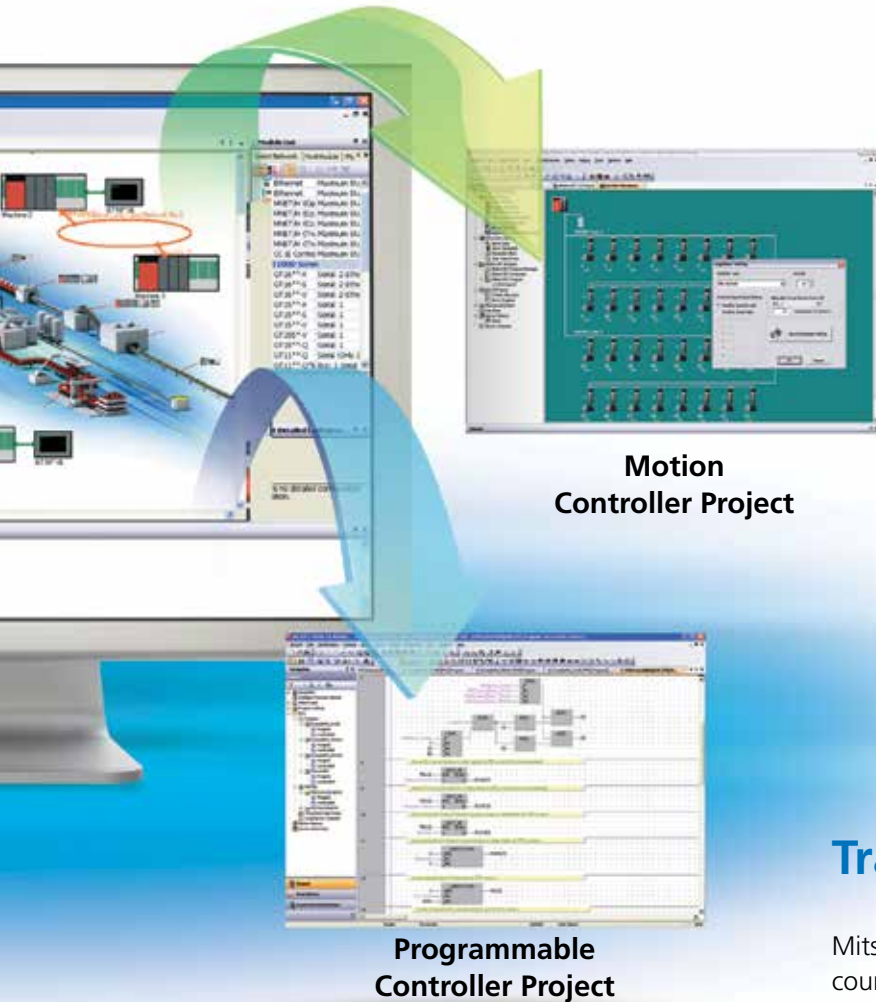
Motion Controller Project